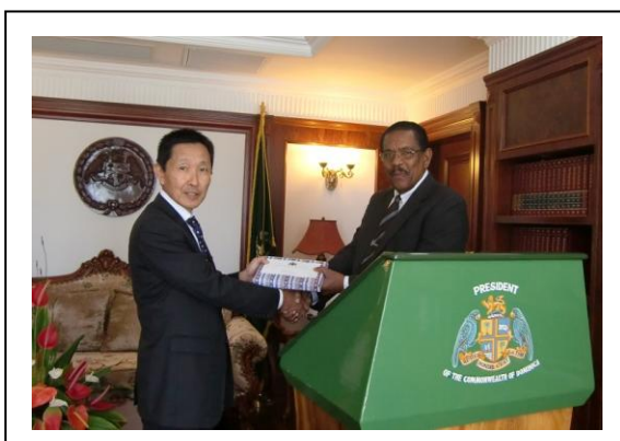
His Excellency Charles Angelo Savarin, D.A.H., President of the Commonwealth of Dominica