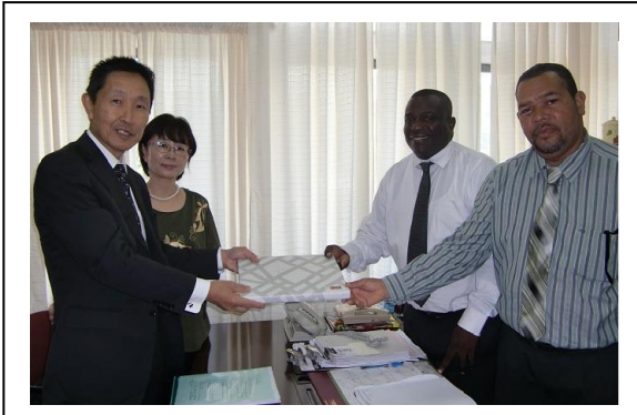
Hon. Johnson Drigo, Minister of Agriculture and Fisheries