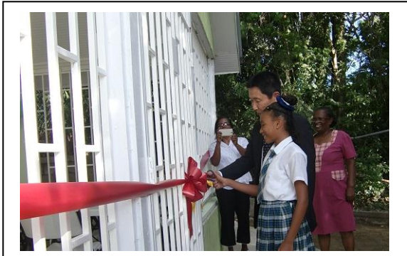
“The Project for Renovating the Cafeteria and the Retaining Wall of the Christian Union Primary School”