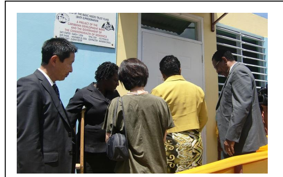
“The Project for Constructing the Dormitory for People with Disabilities”