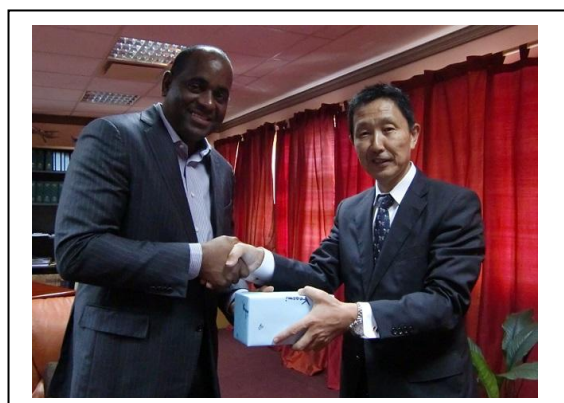
Hon. Roosevelt Skerrit, Prime Minister