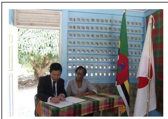
“The Project for Renovating Dominica Community High School”